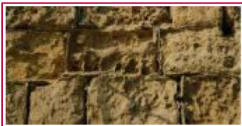
Imagen de visu

This predisposition to alteration of diagenetic origin, is speeded by existing gypsum and other sulphates efflorescences, external to the rock.