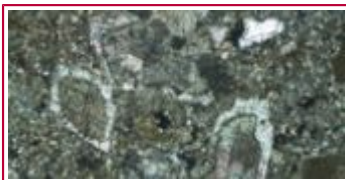
Imagen detalle / macro

been produced by differential dissolution the anomalous dolomite crystalline.