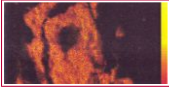
Figure1. X Ray image. Mg - EPMB CamecaX50-1500X